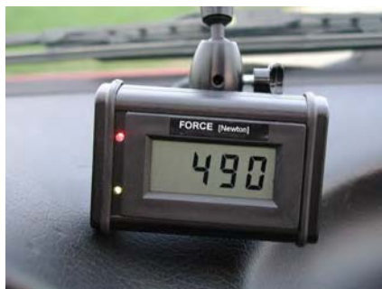
PFD - Pedal Force Display

The PEGASEM PFS pedal force sensors have been developed for homologation tests of vehicle brakes. Many testing procedures demand the exact recording of the pedal force applied during a brake test, e.g. ECE R-13, ECE R-90, DIN70028, MVSS135 , MVSS121.