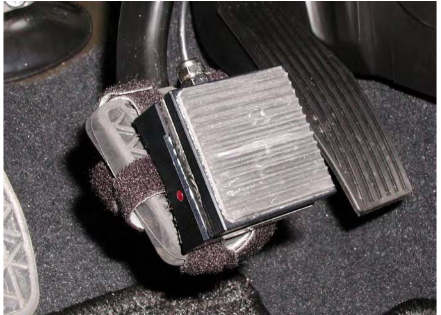
PFS fitted to Brake Pedal

The PEGASEM PFS pedal force sensors have been developed for homologation tests of vehicle brakes. Many testing procedures demand the exact recording of the pedal force applied during a brake test, e.g. ECE R-13, ECE R-90, DIN70028, MVSS135 , MVSS121.